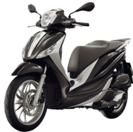
PIAGGIO MEDLEY or similar