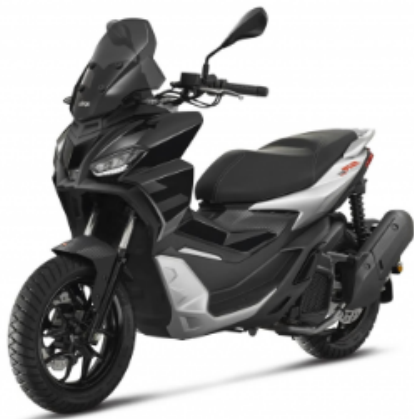
APRILIA SR GT or similar